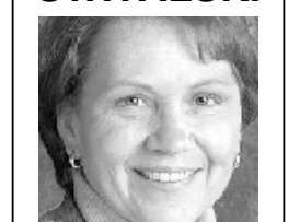
Photo Has Been Age Progressed DOB: Sep 14, 1946 Sex: Female Race: White Missing: Jul 15, 1963 Hair: Blonde Age Now: 70 Eyes: Hazel From: Chicago, IL NATIONAL CENTER FOR MISSING & EXPLOITED CHILDREN