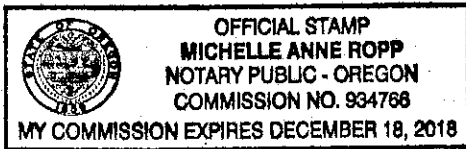
Notary Public-State of Oregon